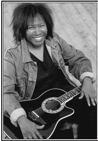
Joan Armatrading to appear at Keswick Theatre on August 23 .

Keswick Theatre at Easton Road and Keswick Ave, in Glenside, presents a rare area performance by Joan Armatrading on Tuesday, August 23 at 7:30 p.m. Armatrading was nominated twice as Best female vocalist for the Brit awards and also received two Grammy nominations for Best Female Vocalist. Tickets ($39.50) are available at the Keswick Theatre box office or charge-by-phone 24 hours at 215-572-7650. Tickets also available at Ticketmaster Outlets at www.keswicktheatre.com .